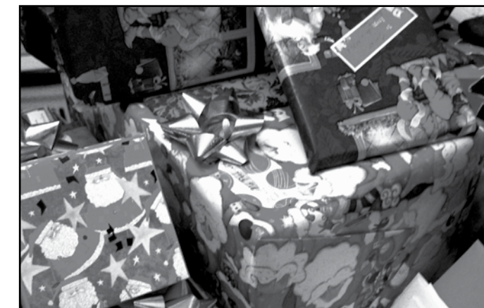
Presents ready to be placed under the tree at Unique Boutique

Finally, one more thank you is needed for those who made the client party possible. The evening concluded with a visitor straight from the North Pole - Mr. and Mrs. Claus arrived at the shelter on a horse-drawn sleigh. Assisted by several elves, they delivered Christmas presents to each and every child residing at the shelter. It was truly a magical night for all in attendance.