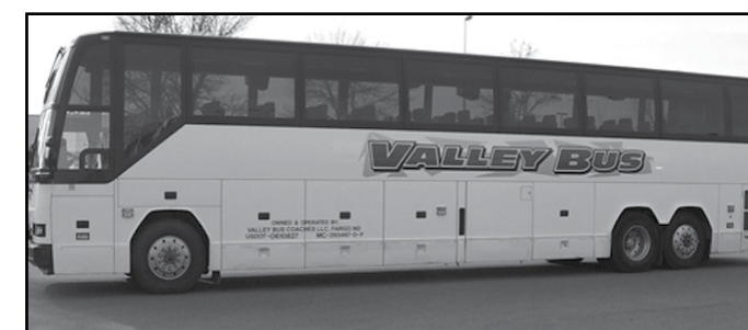
The "stuffed" bus, courtesy of Valley Bus