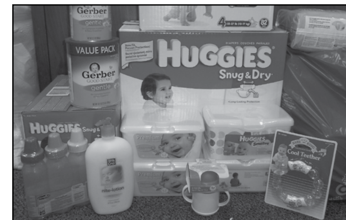
This was just part of the three car-loads full of baby items the United Way's 35 Under 35 program collected for the shelter - wow!

Over 25 groups and numerous individuals donated diapers, wipes, baby formula, bottles, sippy cups, and baby monitors. Through your support, we have been able to continue to provide the essential items for moms and babies who seek the safe haven of the YWCA. Thank you!